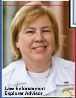
Law Enforcement Explorer Advisor

“Scouting builds much stronger adults because they understand things aren’t just handed to you. It prepares them for life. The things they learn in Scouting, and sense of self-esteem they gain, do great things.”